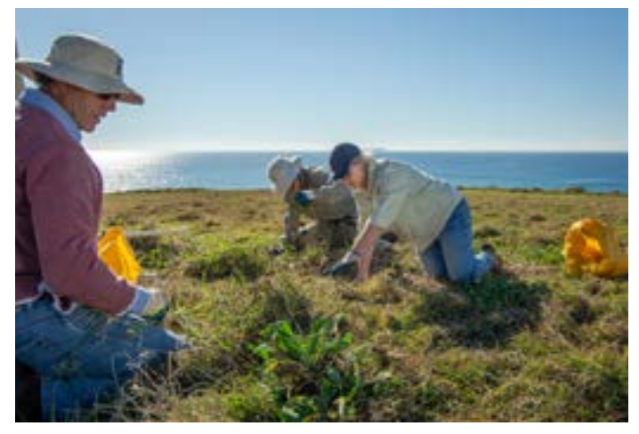
There are more than 35 Landcare groups working across the Jaliigirr region.

Coffs Harbour Regional Landcare coffsharbourlandcare.org.au/