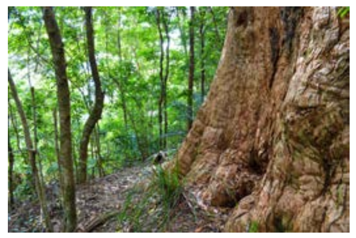
Giant Tallowwood - once common, now rare.

More recently, vegetation clearing has fragmented this landscape, and as a result, many sensitive species have declined.