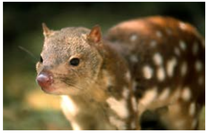
The Jaliigirr Alliance region includes an important core area for the Spotted-tailed Quoll, which is endangered at the national level and vulnerable at the state level.

We have now planted more than 1800 trees across the property and also removed many Camphors from along the creek. The major benefits are long term, but I've already seen more birds moving into the area and a breeding colony of Moonbeam butterflies has established.